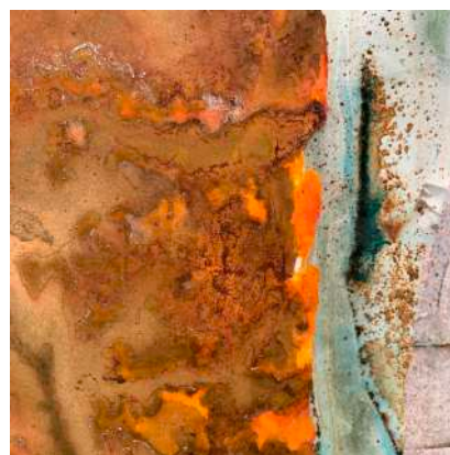
Purdey Fitzherbert, Bleached sepia and burnt sienna tones , 2021 (detail)