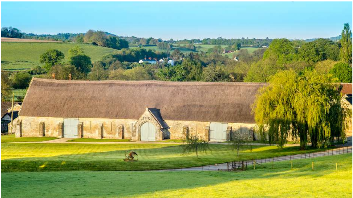
Thirteenth century tithe barn, Messums Wiltshire

We hope you will join us to share in these exhibitions and events we have programmed from August through to November.