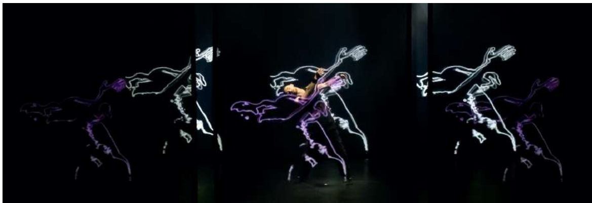
Alexander Whitley Dance Company, Festival of Dance 2022.

The second transformation of the barn gallery will take place mid-summer when we run our annual Festival of Dance . Starting on 14 July, the 10-day festival will offer a lively programme of dance-focused activities, ranging between dance shows, workshops, Q&As with artists, dinner and dance parties. In addition, the final Sunday of the festival will be dedicated to the inaugural Messums Dance Film Festival, in which selected work of national and international dance filmmakers will be screened and awarded.