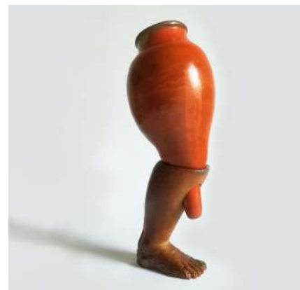
Sandrine Bringard, Marche, 2019