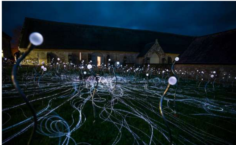
Bruce Munro, Messums Wiltshire, 2019

The year will conclude with a dramatic spectacle of light at Messums Wiltshire to round off a year of celebratory activity. An installation by British artist Bruce Munro will illuminate the thirteenth century barn and surrounding landscape. Munro's work takes ordinary objects and invites people to look at them in a different way. Through repetition and ordering they become dramatic backdrops to mesmerising, mysterious and immersive displays that transcend time and space.