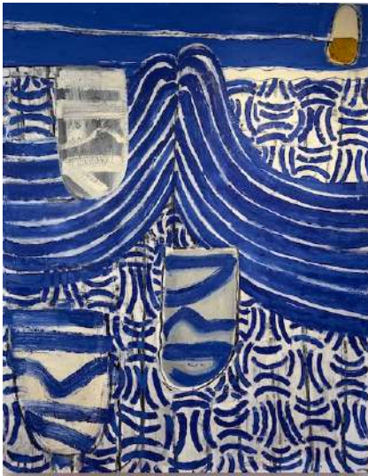
John Walker, Eel Running Pemaquid, 2022

Our celebration of painting continues throughout the spring in our London gallery where we will be presenting recent paintings by internationally applauded abstract painter John Walker . This will include a dynamic series of seven large scale, predominantly blue and white, canvases, all completed in the last year. Pared down, bold and expressive, these paintings are full of vigour, vitality and freedom reflecting an artist who, now in his ninth decade, is working with as much fervour as ever.