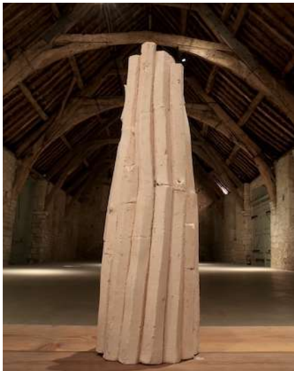
Maquette, Messums Wiltshire, January 2023

A dramatic high point of the ceramics season will be the breath-taking spectacle of the building and firing of a six-metre-tall wood-fired kiln by French ceramicist Thiébaut Chagué whereby the act of making becomes part of the exhibition. Once the kiln is constructed, Chagué will fire a larger-than-life sculpture, created on site from moulded and extruded clay forms, in a celebration of fire, clay and landscape.