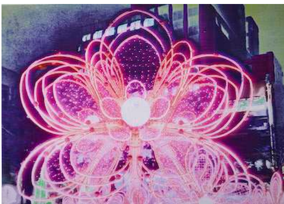
Jean-Vincent Simonet, Sapporo Lights #4, 2022

Contemporary French photographer Jean-Vincent Simonet's practice fuses analogue images, digital techniques, collage, montage, sculpture and painting with remarkable fluidity, giving the resulting images a distinctly painterly quality. We will be displaying Simonet's work at Photo London from 10-14 May together with images by Jeffrey Milstein , Polly Penrose and Yan Wang Preston .