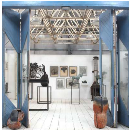
Frink Studio, 2022

A series of in-focus displays will take place throughout the year in our Frink Studio now sited at a location near Messums Wiltshire. In 2019, the working world of Elisabeth Frink arrived at Messums Wiltshire with the reconstruction of her Woolland studio in our historic tithe barn. The studio was rescued from collapse and revived as an exhibition space displaying works from Frink's studio and elements of her working practice and environment. As well as providing insight into her creative process, it forms a backdrop to a programme of events exploring creative environments and will now include opportunities to see work relating to our recent and forthcoming London exhibitions.