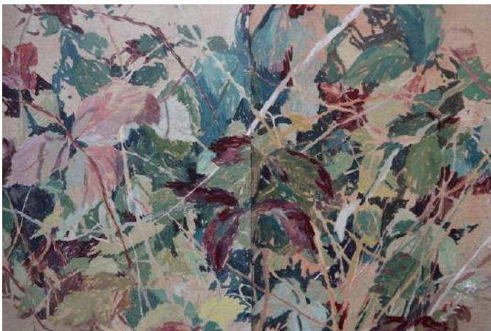
Tyga Helme, Love's Growth

Taking centre stage at Messums London over the summer months will be the work of two young female painters shown in succession. First, will be an exhibition of rising star in the new British Landscape movement Tyga Helme whose work embodies an awakening to the importance of the ground beneath our feet by shifting our perspective in a literal sense on the view we take to the landscape and harnessing the power of colour as language. Helme's exhibition will be followed by a solo presentation of new paintings by Tuesday Riddell . For Riddell, there is a parallel to be drawn between endangered crafts and endangered species, and her work attempts to draw attention to both. It is as much concerned with the natural world as it is with processes of making; in the midst of the ecological crisis, the delicate, intricate japanning technique reflects the fragility of our ecosystems and our complex relationship with the natural world.