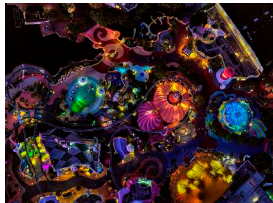
Jeffrey Milstein, Universal Orlando Seuss Landing, 2019