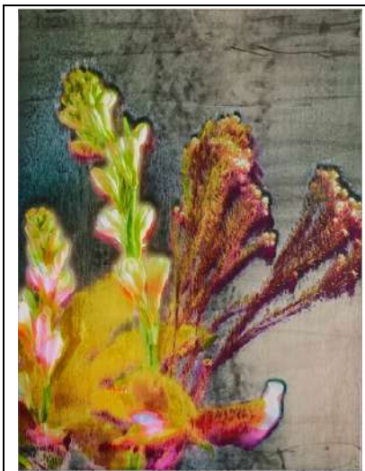
Novembre Flowers #3, 2022 , Unique Inkjet ultrachrome print on plastic foil, washed and fixed, 138 x 98 cm

Atem's photographic images are both studies of history as well as portraits of people and explore storytelling, performance and costume as pillars of cultural expression. She is also interested in 1950s kitsch interiors, and sci-fi tropes as she is in the cultural heritage of South Sudan, Kenya and Australia – places which all form part of her own identity. Interested in the way that visual histories and narratives shape identity, she uses them in a playful way, layering different identities and references to create images that have a maximalist aesthetic.