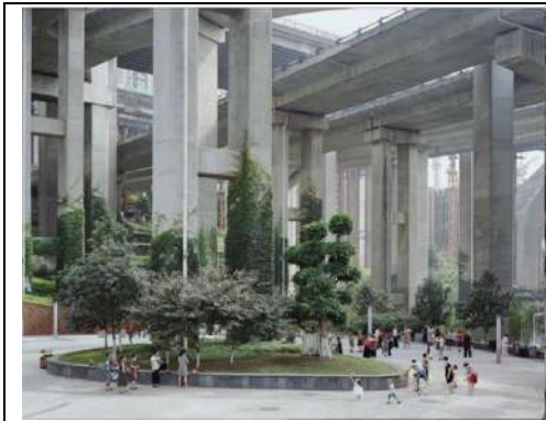
Egongyan Park, Chongqing, China, 2017 Edition 3/3, Chromogenic Print, 120 x 150 cm