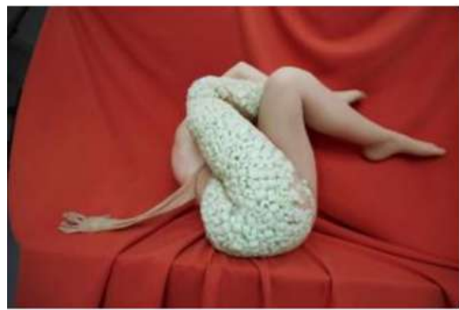
Self Portrait Stuffed with Packaging Nuggets , Hackney, February 2021 (edition 1/8) Photo rag baryta paper 50 x 74 cm