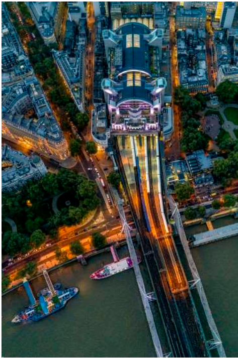
London Charing Cross Station