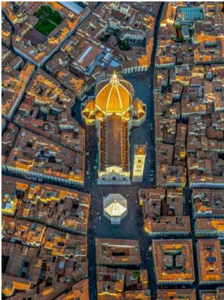
Duomo di Firenze