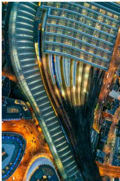
Waterloo Station (Night), © Jeffrey Milstein

The same occasion will celebrate the launch of the first large-scale publication produced by the artist entitled FLYING . Vast in scale at height 22" x width 28.75" x depth 3" with a silver fabric cover and embossed text, the book features 59 full-scale prints and an introduction by James Crawford, writer and broadcaster of BBC One documentary series Scotland from the Sky . Crawford comments: 'From the sky, Milstein turns row after row of LA backyards, trees, houses and car parks into a remarkable unfolding structure, like living cells growing under a microscope. London's Waterloo Station at night becomes a beautiful, iridescent sea shell, or the beginnings of a DNA double helix.