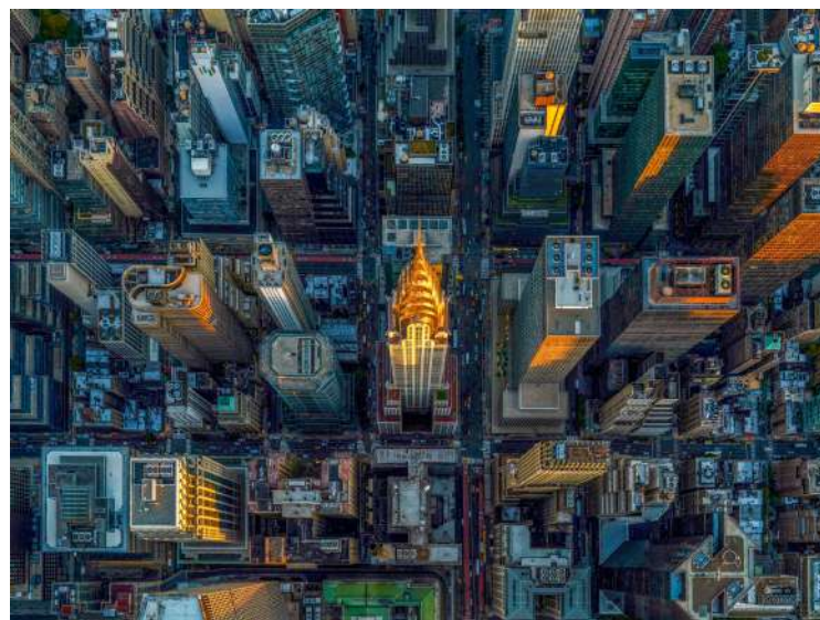
NYC Chrysler Building 2

Crawford highlights the significance of these images, 'This, of course, is what the view from above does better than anything else. It shows that our world never stops changing, not even for a second. It shows that our cities are hard-wired for change – always growing, shifting, suffering or thriving. Always regenerating and rewriting themselves. And one thing is for certain. The landscapes that Milstein – and, thanks to his photography, we – look down on today, will not be the landscapes of tomorrow.'