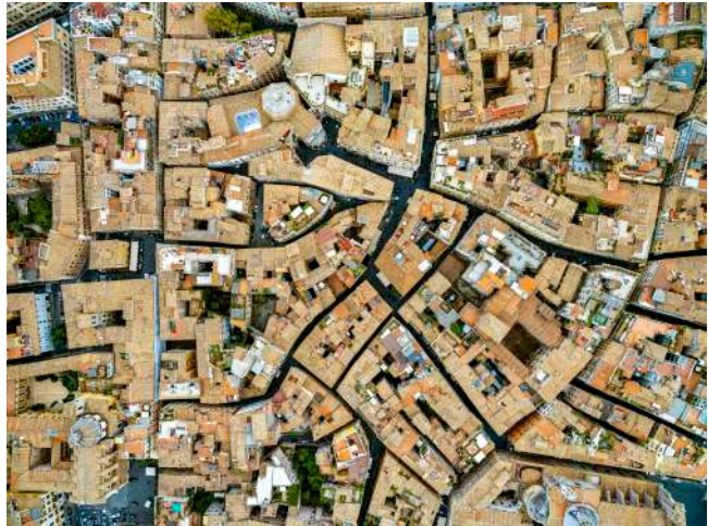
Rome Neighbourhood near Piazza Navona © Jeffrey Milstein

The same occasion will celebrate the launch of the first large-scale publication produced by the artist entitled FLYING . Vast in scale at height 22" x width 28.75" x depth 3" with a silver fabric cover and embossed text, the book features 59 full-scale prints and an introduction by James Crawford, writer and broadcaster of BBC One documentary series Scotland from the Sky . Crawford comments: 'From the sky, Milstein turns row after row of LA backyards, trees, houses and car parks into a remarkable unfolding structure, like living cells growing under a microscope. London's Waterloo Station at night becomes a beautiful, iridescent sea shell, or the beginnings of a DNA double helix.