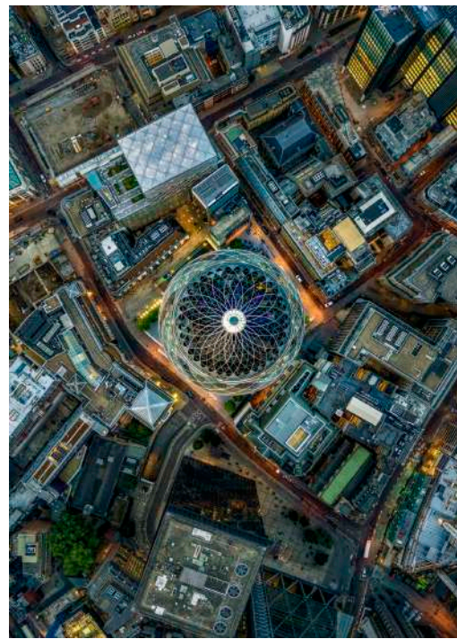
London Gherkin

Crawford highlights the significance of these images, 'This, of course, is what the view from above does better than anything else. It shows that our world never stops changing, not even for a second. It shows that our cities are hard-wired for change – always growing, shifting, suffering or thriving. Always regenerating and rewriting themselves. And one thing is for certain. The landscapes that Milstein – and, thanks to his photography, we – look down on today, will not be the landscapes of tomorrow.'