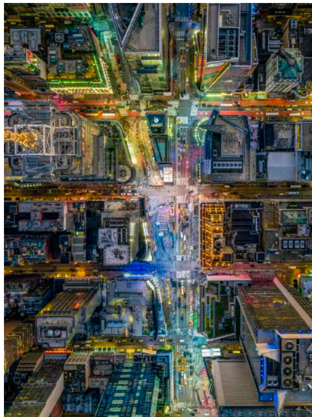
NYC, Times Square

Preview and Book Launch: 22 November, 6-8pm