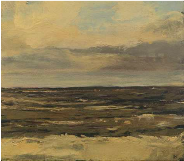
Seascape II, 2021, Oil on board, h. 15 x w. 17 cm

Messums has successfully supported British landscape painters since its founding in 1963 and Mooney's studies in oil suggest a conversation between the traditional legacies of landscape painting and her personal and emerging contemporary perspective.