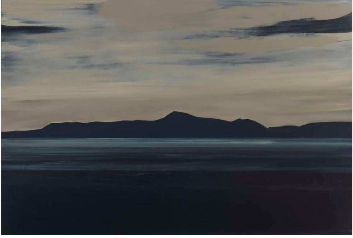
Clew Bay at Dusk, 2022, Oil on board, h.56 x w.83 cm

26 November – 31 December 2022 Preview: 25 November, 6:30pm