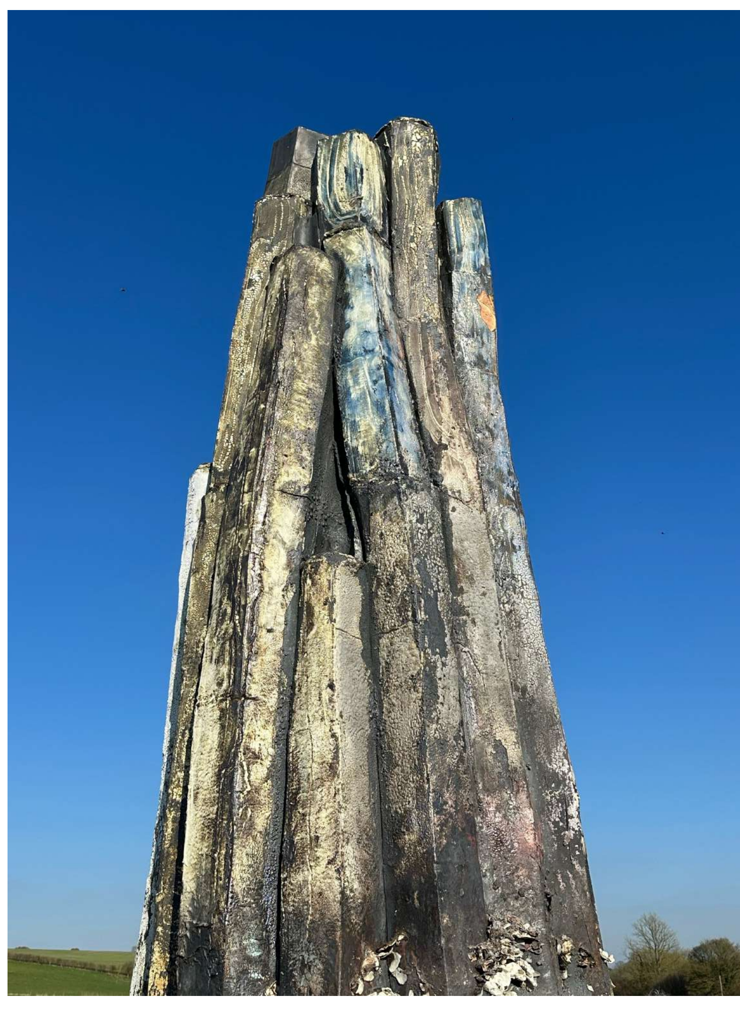
'Ascension'