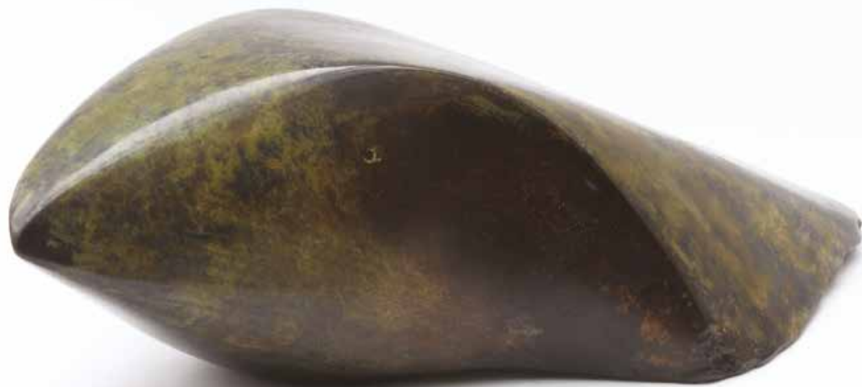
Bridget McCrum 20 Longtail Bird Bronze - edition of 9 h 13 x w 15 x d 43cm