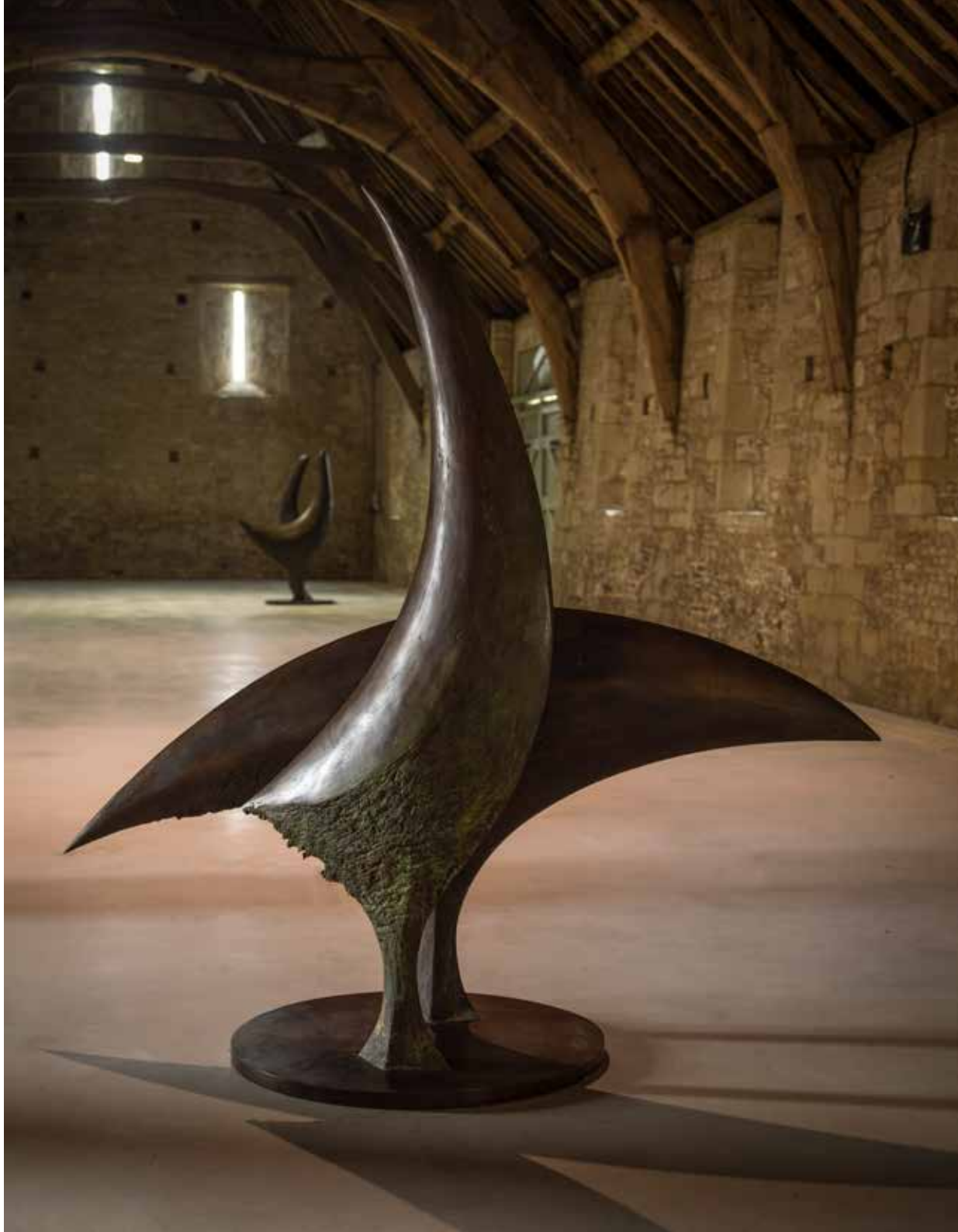
Bridget McCrum 14 Crescent Birds Bronze - edition of 6 h 70 x w 70 x d 20cm