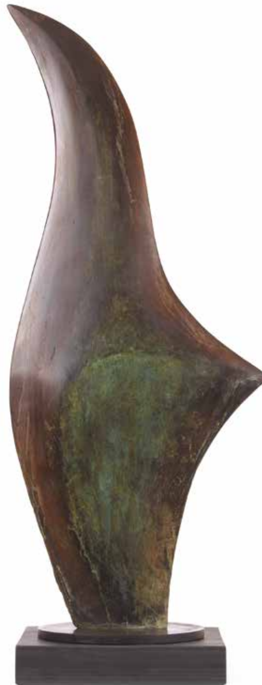
Bridget McCrum 17 Blade Bronze h 88 x w 37 x d 6cm