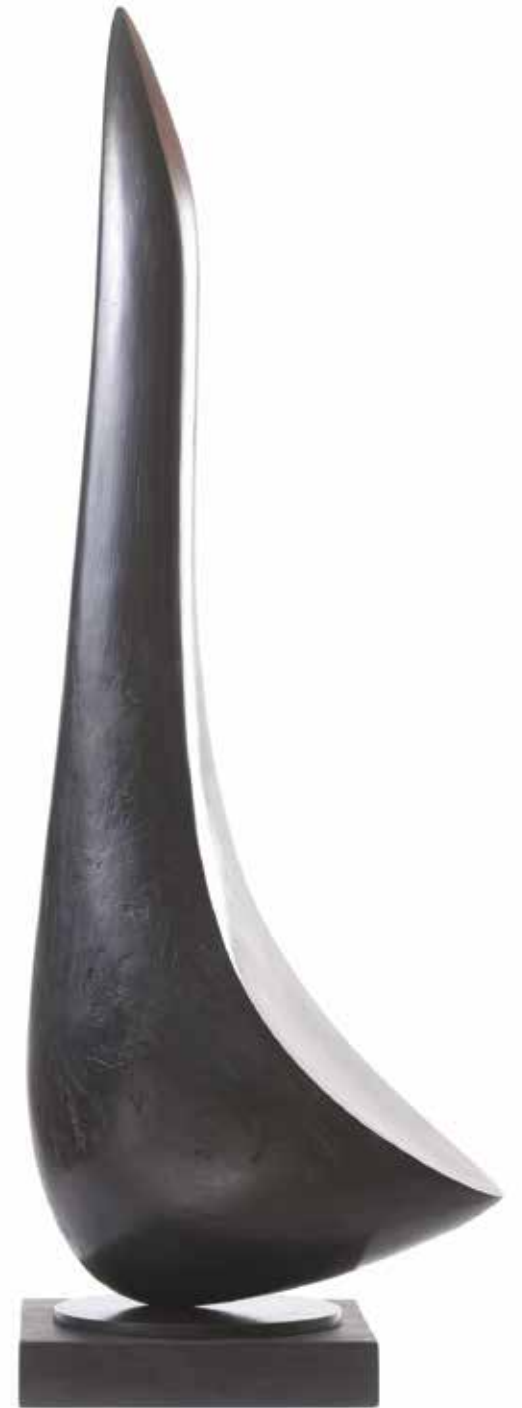
Bridget McCrum 15 Eclipse Bronze, edition of 9 h 105 x w 42 x d 17cm