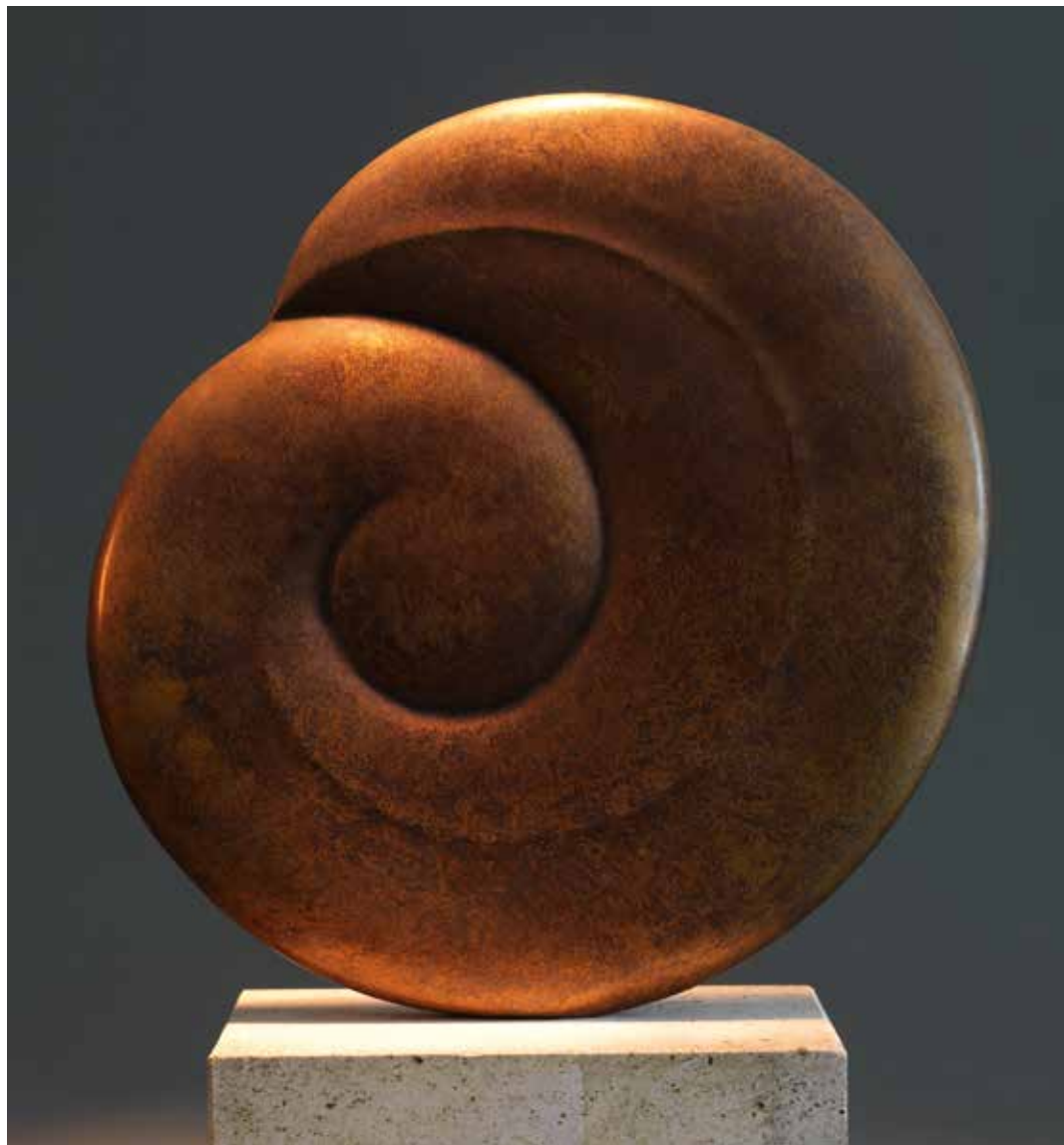
10 Embryonic Form Bronze, edition of 11 h 32 x w 32 x d 4cm