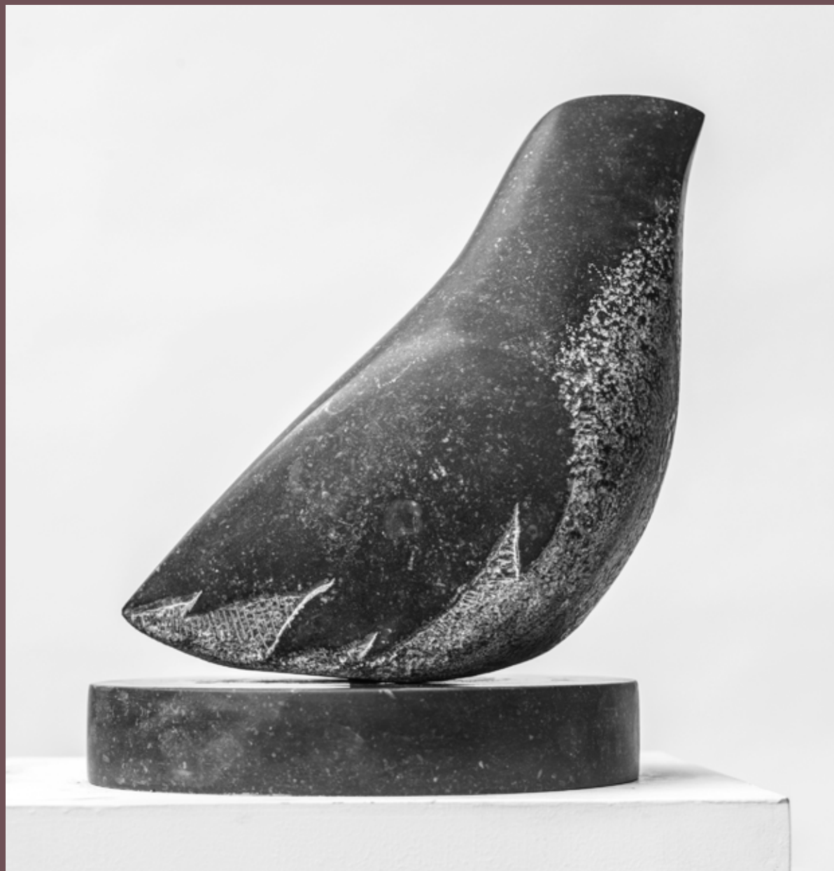
Bridget McCrum 16 Zenobia (Homage to Palmyra) Bronze h 33 x w 31 x d 18cm