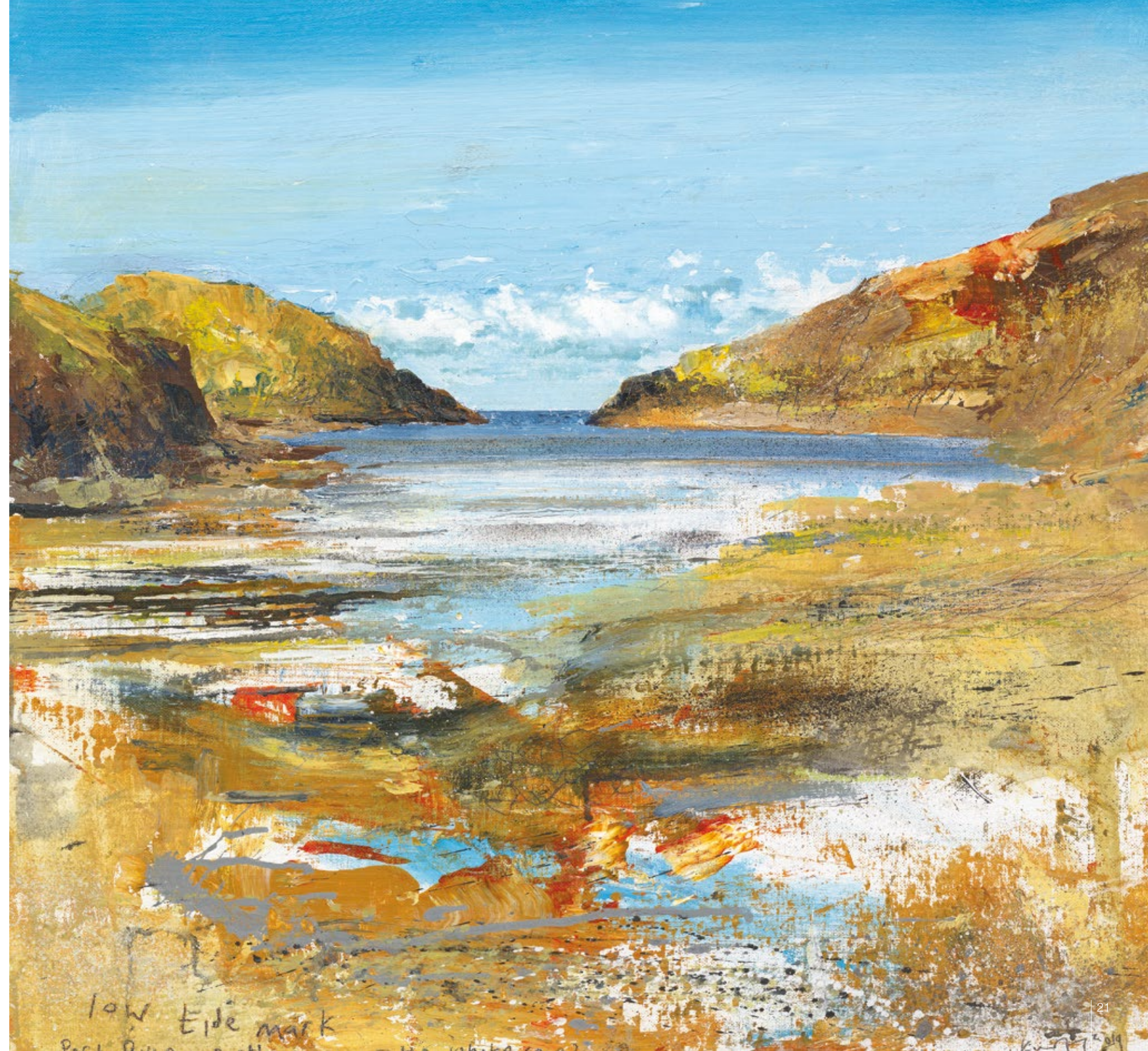
8 Low tide mark, 2019 Mixed media on canvas board 61 x 61cm