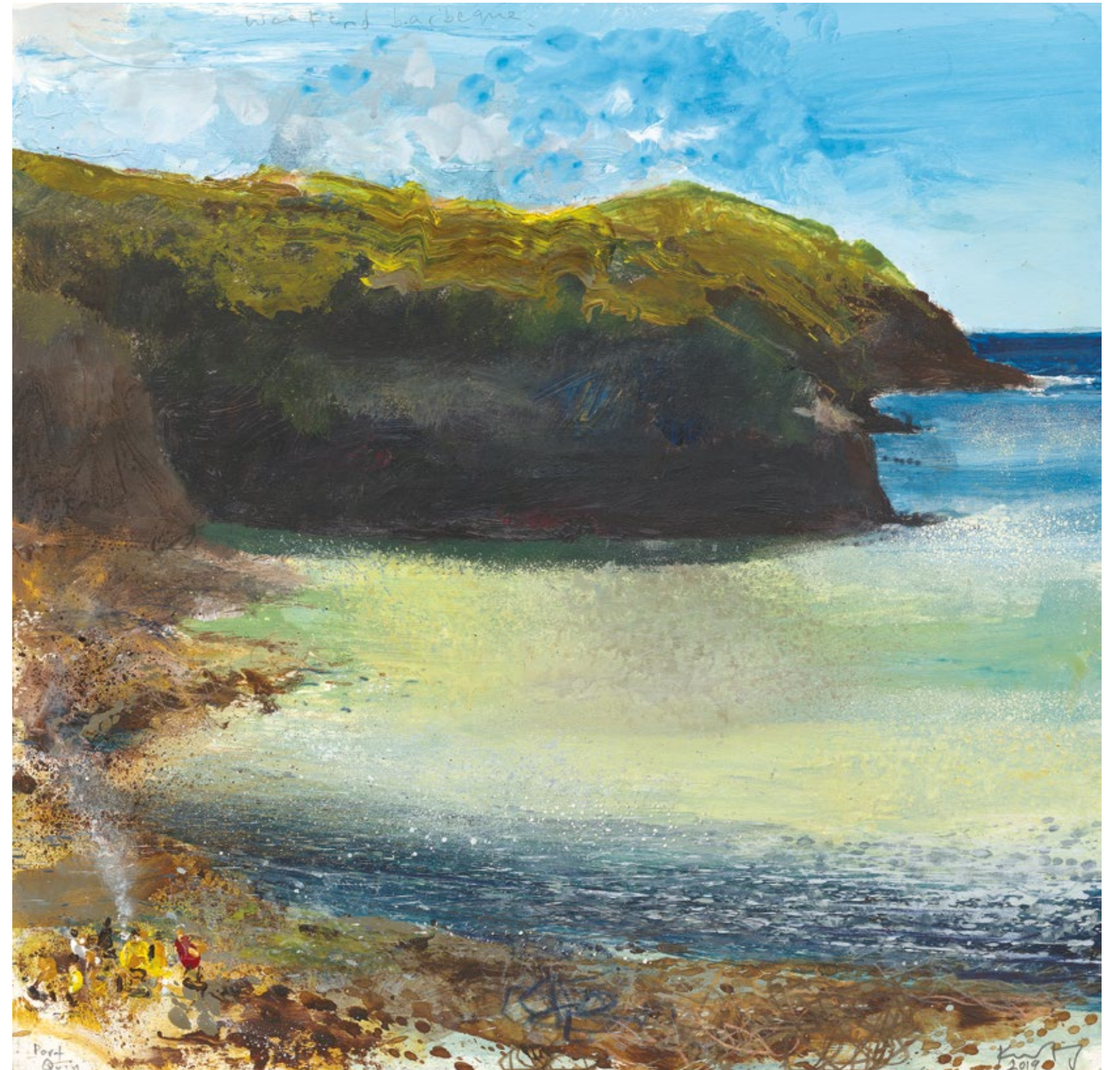
24 Weekend barbecue, 2019 Mixed media on museum board 41 x 41cm