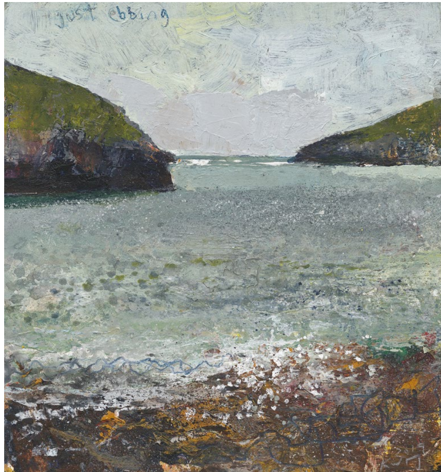
20 Just ebbing, 2019 Mixed media on museum board 22.5 x 21cm