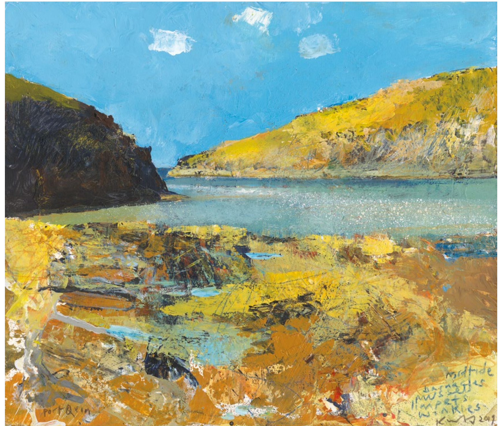
16 Mid-tide barnacles, mussels, limpets and winkles, 2019 Mixed media on museum board 26 x 30cm