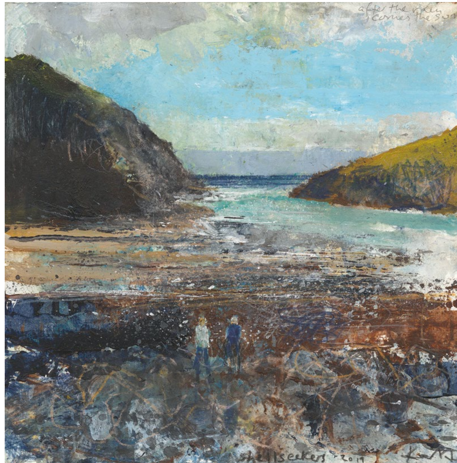
14 Shell seekers, 2019 Mixed media on museum board 23 x 23cm