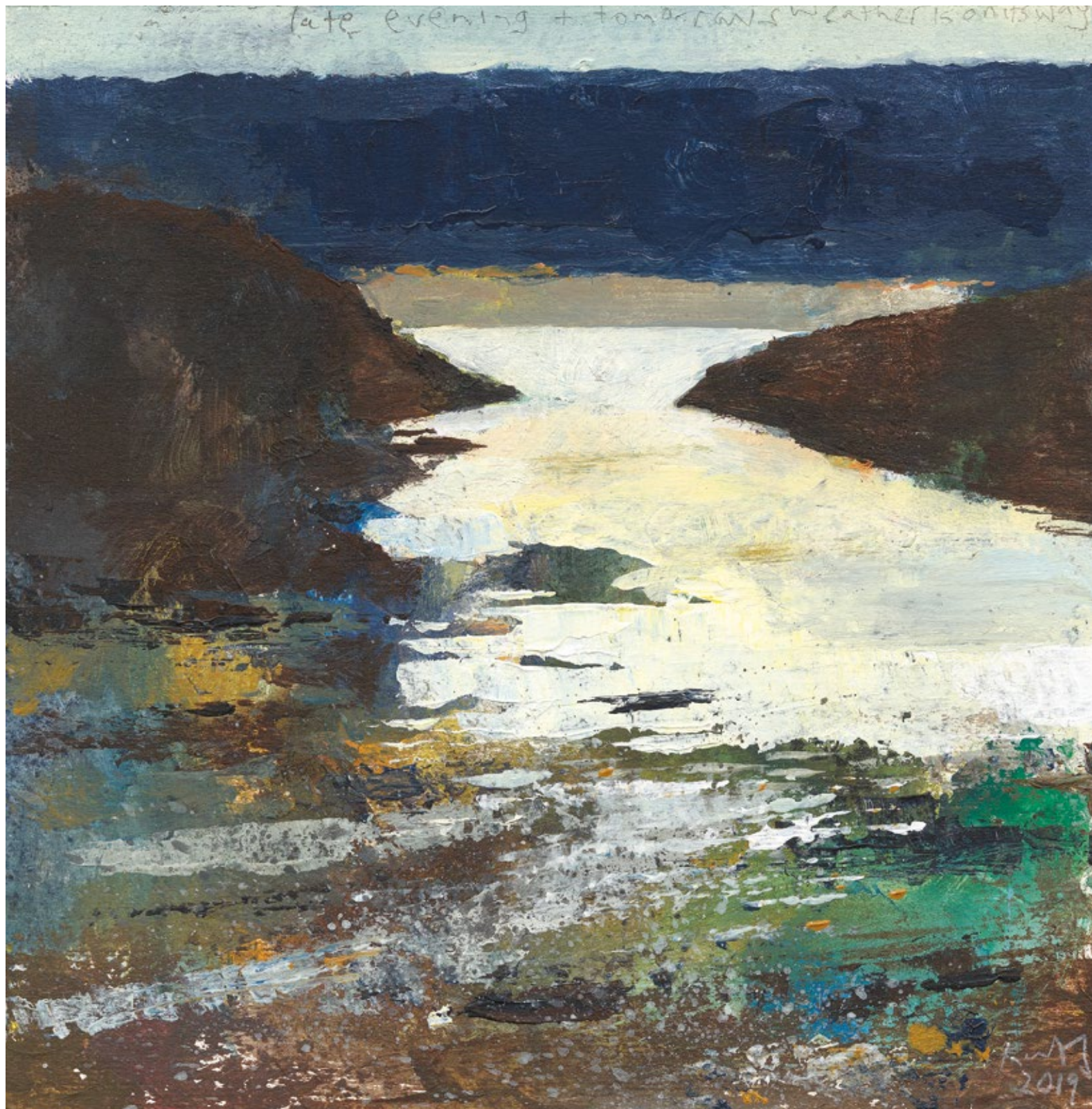
11 Late evening and tomorrow's weather is on its way, 2019 Mixed media on museum board 24 x 24cm